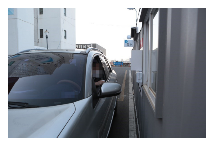
Fig. 3. A two-way microphone is used during communication between an individual and a doctor. The doctor and individual view one another through the window and talk via the microphone.

After this screening, the doctors decided whether the individual needed to be tested, whether a nasal and throat or sputum test should be performed, and whether insurance would cover the testing. The test was then prescribed, and if covered by insurance, the physician completed a document called an "infectious patient report" online and sent it to the KCDC. The doctors asked the individuals questions through two-way microphones, and there was no contact between them (Fig. 3). Therefore, the risk of coronavi-