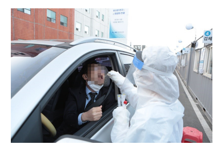
Fig. 5. Throat swab procedure.